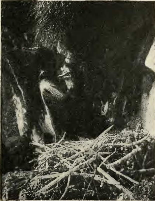
White-crested Cormorant ( Phalacrocorax dilophus cincinnatus ). Old and young.

by 41, and the smallest, except the runt, was 52.2 by 39.5. The runt measured 41 by 28.5. The eggs are about equal ended, with plumper outlines and blunter and more rounded ends than the typical cormorant egg. Careful scrutiny reveals the